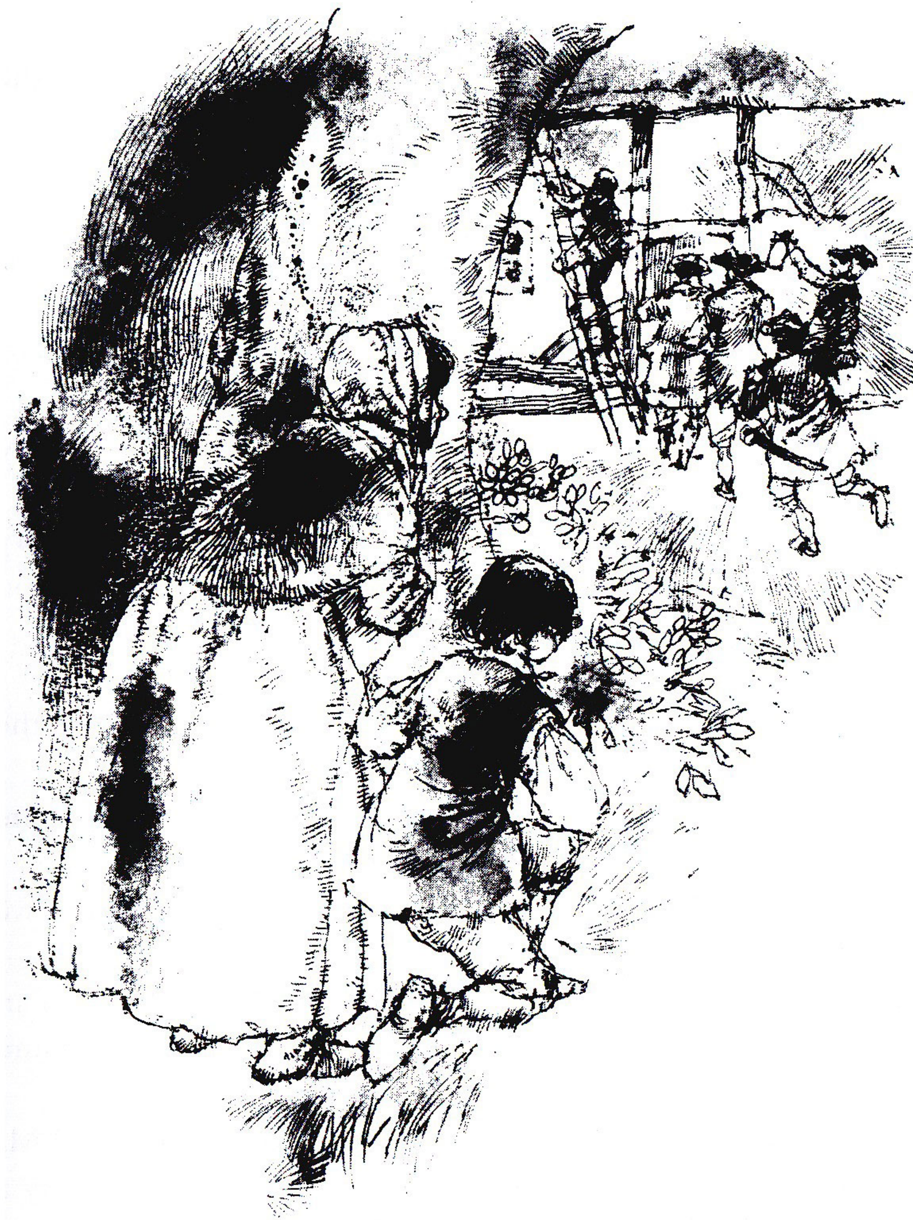
We stopped behind some trees and watched the men.

Then I heard a gun. The pirates heard it too, and began to run