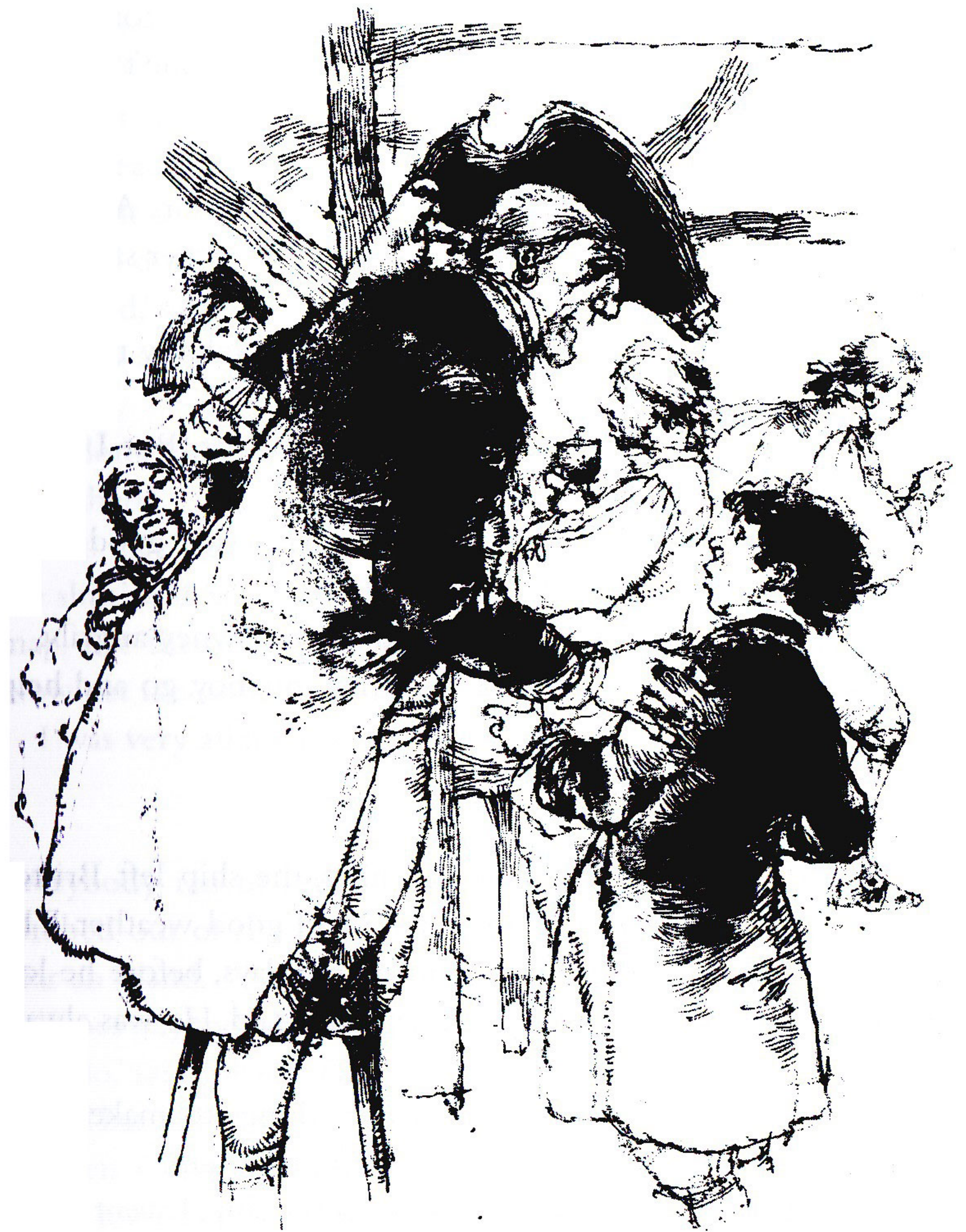
Long John Silver turned to me. 'Who was that man?' he asked. 'Black what?'

'Well, sir,' said the captain, 'it is, but I'm not happy about it. I don't like the sailors.'